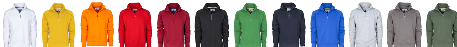
BIANCO GIALLO ARANCIONE ROSSO BORDEAUX NERO JELLY GREEN BLU NAVY BLU ROYAL GRIGIO MELANGE SMOKE VERDE